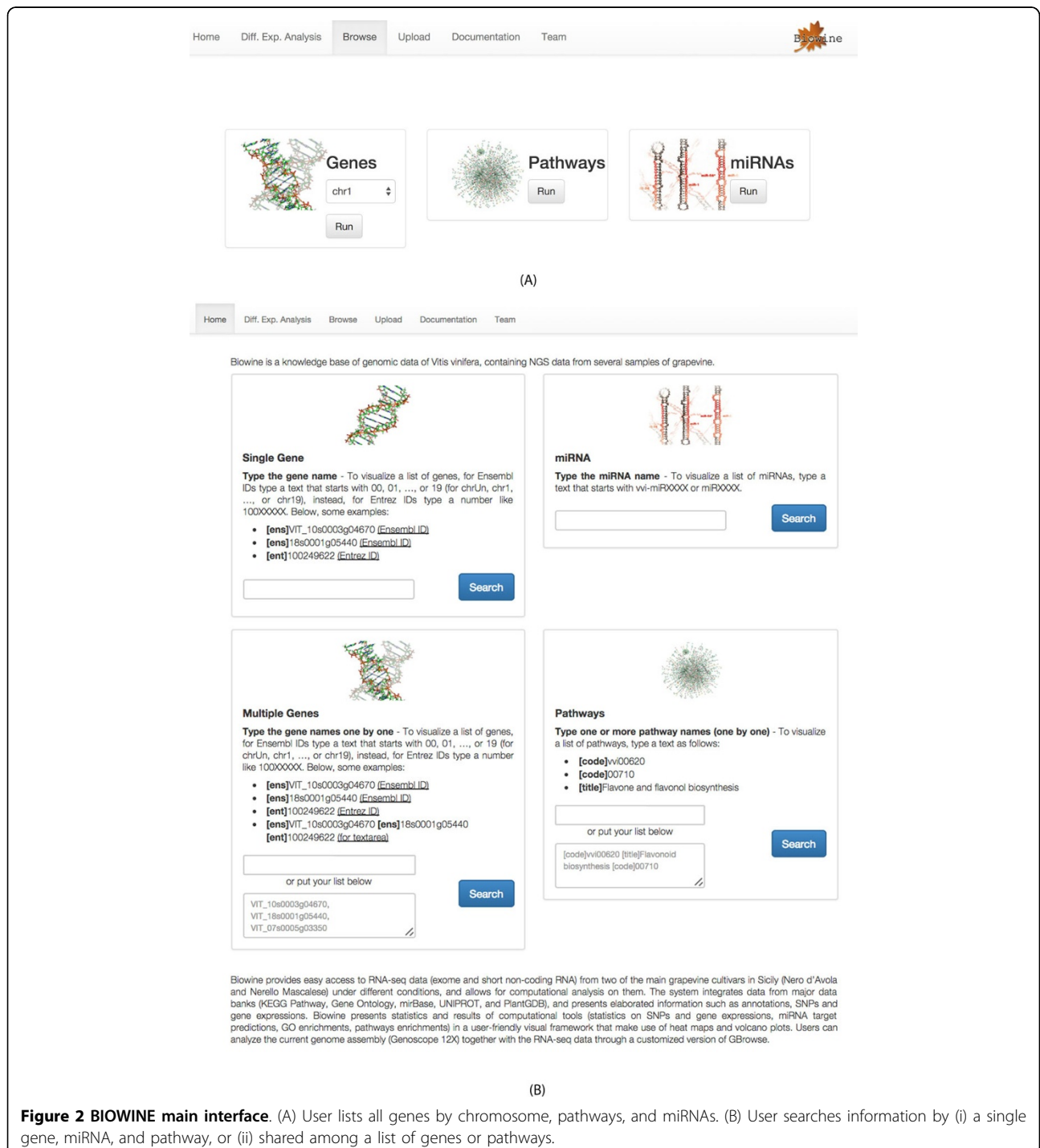
Figure 2 BLOWINE main interface. (A) User lists all genes by chromosome, pathways, and miRNAs. (B) User searches information by (i) a single gene, miRNA, and pathway, or (ii) shared among a list of genes or pathways.

Search by multiple genes. The search by multiple genes works by pasting a list of genes (see Figure 2 (B)). The search can be done either by gene names (e.g. VvMYBA1) or by external identifiers from NCBI or EBI.